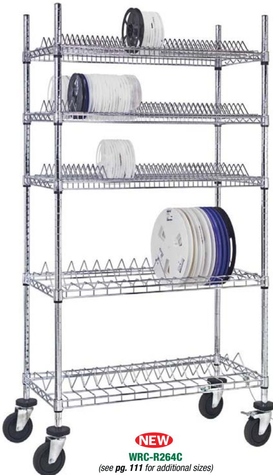
NEW WRC-R264C (see pg. 111 for additional sizes)

Quantum Reel Shelving offers a safe and efficient method of transporting and storing standard size component reels. New reel shelves are chrome plated and can be used in conjunction with same size standard flat wire shelves. Units are available with conductive accessories providing a static safe storage system to address reel handling and providing stationary or mobile complete storage systems for PCB manufacturers. Finish: Chrome