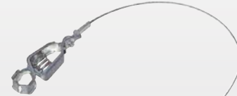
ESD-DC Drag Chain