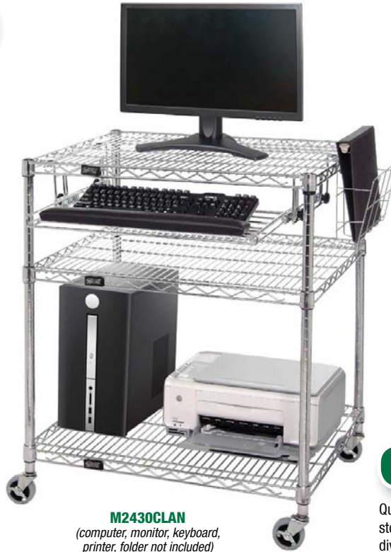
M2430CLAN (computer, monitor, keyboard, printer, folder not included)