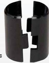
WR-SSCO Conductive Plastic Split Sleeves