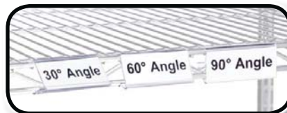
LHA3C 3 Different Angles