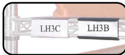
LH3C and LH3B Front Shelf View