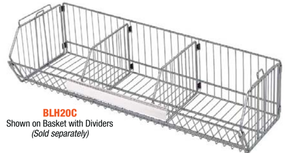
BLH20C Shown on Basket with Dividers (Sold separately)