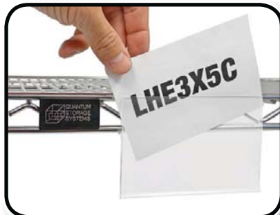
Clear Label Holder