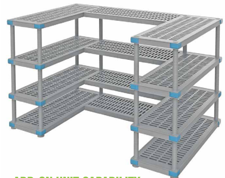
ADD-ON UNIT CAPABILITY (U-SHAPE)