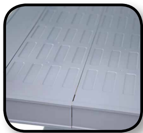
SHELF WITH SOLID SURFACE