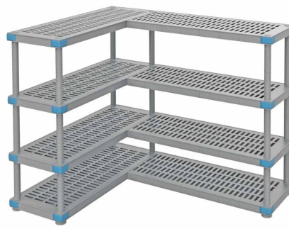
ADD-ON UNIT CAPABILITY (L-SHAPE)