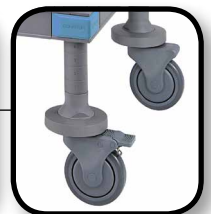
UNIT CAN BE STATIONARY OR MOBILE

Maximum load capacity evenly distributed ▶