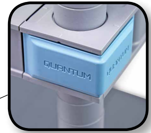
PRIVATE LABEL CAPABILITY