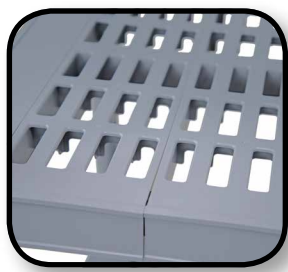
SHELF WITH VENTED SURFACE