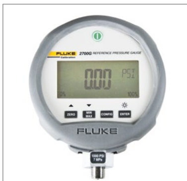
Digital pressure gauge