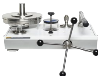
Deadweight testers generate and control pressure in a calibration system.

Deadweight testers and the related electronic deadweight tester are portable systems that provide all three functions—generation, control and measurement—in a single unit, and are suitable for both field and bench use.