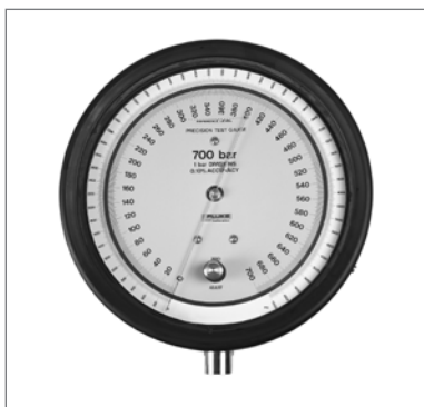
Analog pressure gauge