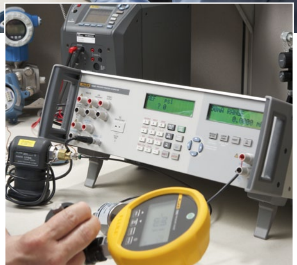
A pressure calibration system needs to accurately measure pressure and may also need to measure pressure transmitters.