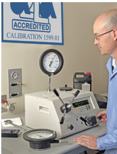
Electronic deadweight tester