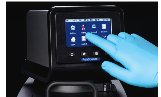
Features include patent-pending Swivel 180™ and a SmartTouch touch-screen.

This Selection Guide is intended to serve as a reference for offerings, model numbers, and specifications. For additional information, visit www.polyscience.com , request a catalog or contact a Customer Service Representative at (847) 647-0611.