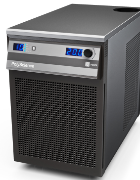
Portable 6000 Series Chiller