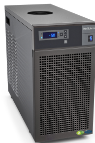
Benchtop Chiller - LS