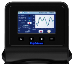
Performance Programmable Advanced Programmable Performance Digital