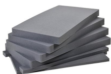
1781 6 pc. Replacement Foam Set