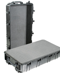
1780WF With Foam