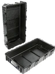
1780NF No Foam