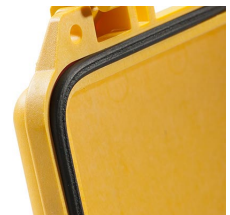
1753 Replacement O-ring

23215 Early Ave • Torrance, CA 90505 USA • Phone: (310) 326-4700 • (800) 473-5422 • Fax: (310) 326-3311 sales@pelican.com • www.pelican.com