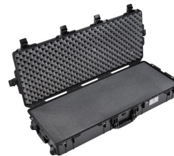
1745WF With Foam