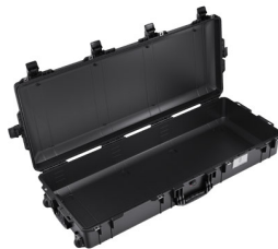
1745NF No Foam