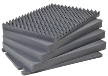
1731 5 pc. Replacement Foam Set