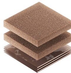
1500CI Corrosion Intercept Kit