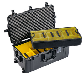
1626WD With Padded Dividers