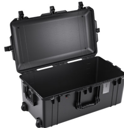
1626NF No Foam