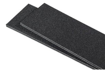
1615TPDIV Extra TrekPak Dividers