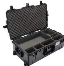
1615TP With TrekPak Divider System