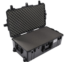
1615WF With Foam