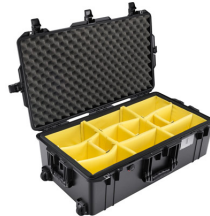
1615WD With Padded Dividers