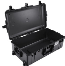
1615NF No Foam