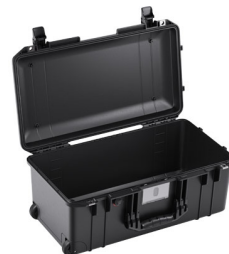
1556NF No Foam