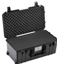
1556WF With Foam