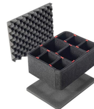
1150TPKIT TrekPak Case Divider Kit