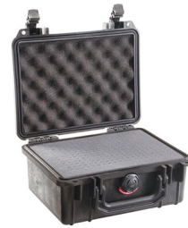
1150WF With Foam