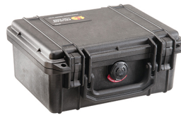
1150NF No Foam