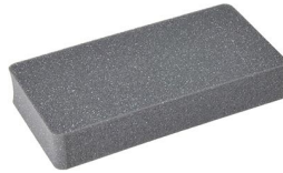
1062 Pick N Pluck™ Foam Insert