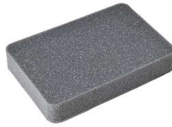
1042 Pick N Pluck™ Foam Insert