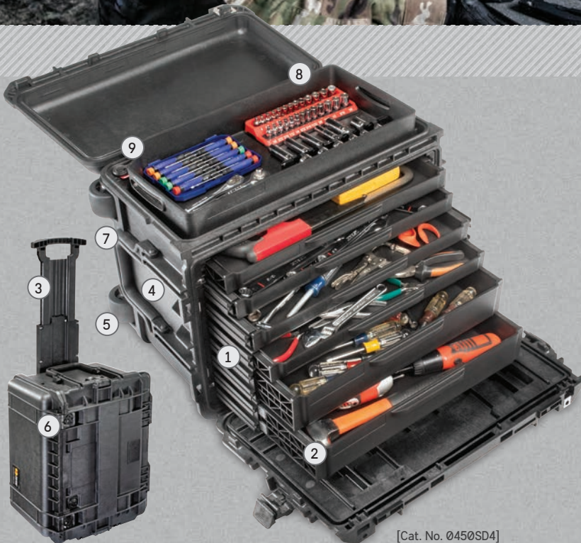
[Cat. No. 0450SD4]