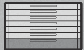
2 Cat. No. 0450SD6