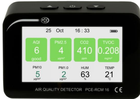
Figure 1 Standard view