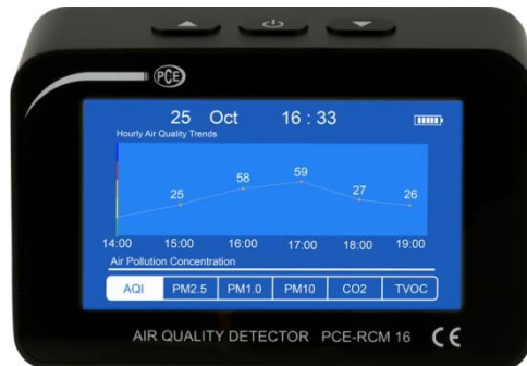
Figure 3 Graphic view