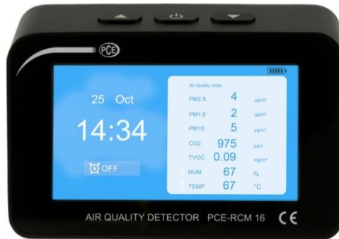
Figure 2 List view