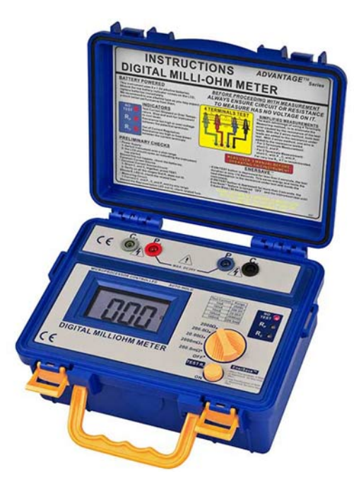
Milliohm Meter PCE-MO 2002 (Milliohm Meter with ruggedized and waterproof carrying case. With highly accurate measurement range)

This Milliohm Meter comes with a housing protected against water intrusion. With the Milliohm Meter PCE-MO 2002 Series you can measure from 100 \mu\Omega up to 2000 \Omega . With this Milliohm Meter measurement values are displayed by means of a LCD display with 3.5 digits and a good readability. Milliohm Meter detect the measurement value, a constant current is mated on the object is going to be measured and then the voltage drop is tested. It allows to measure resistance in coils, generators, transformers, parallel and secondary circuits, commutators and relays. It measures binding energy in planes, rail systems, boats and electrical installations in both industry and home. It allows continuity tests in circularly systems (ring network) in industry and home. To test compression elements in airlines, testing works and maintenance of electric cupboards and elements such as fuses, connectors, and contacts. It comes calibrated from the manufacturer and an optional laboratory calibration and ISO certificate can be ordered separately for annual recalibrations.