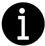
General Product Information