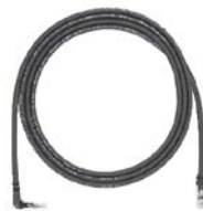
AVT System Cable