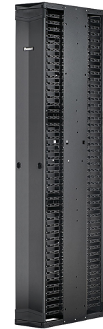
PatchRunner™ 2 Enhanced with Vertical Patching PE2V* Series