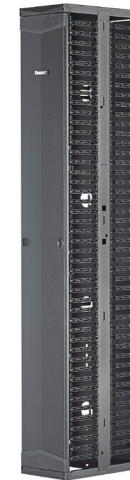
PatchRunner™ 2 PR2V* Series