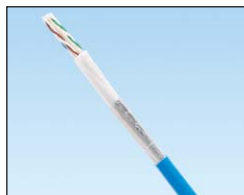
PUP6ASD04BU-UG and PUR6ASD04BU-CG