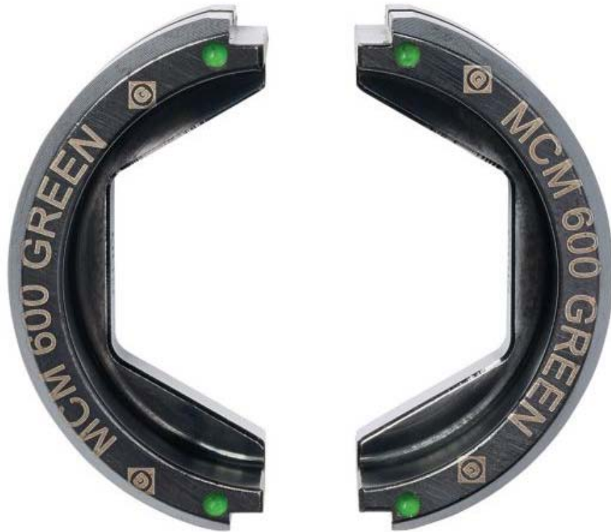
NOTE: PICTURE FOR REFERENCE ONLY