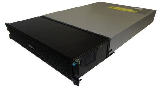
Inlet Duct for Top-of-Rack Switch Applications

Bracket supports switch during installation: Allows single person ease of switch installation