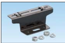
FR6CS12 FR6CS58 FR6CS12M FR6CS58M