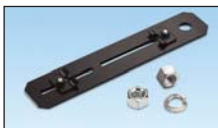
FR6TRBN12 FR6TRBN58 FR6TRBN12M FR6TRBN58M