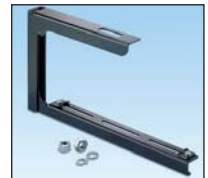
FR12ACB12 FR12ACB58 FR12ACB12M FR12ACB58M