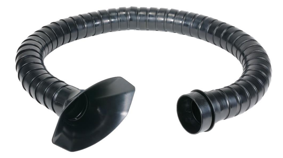
SteadyFlex<sup>™</sup> ESD-Safe Flex Arm & Nozzle Assembly