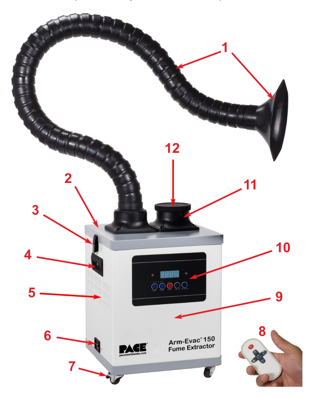
Arm-Evac 150 Fume Extraction System comes complete as shown above