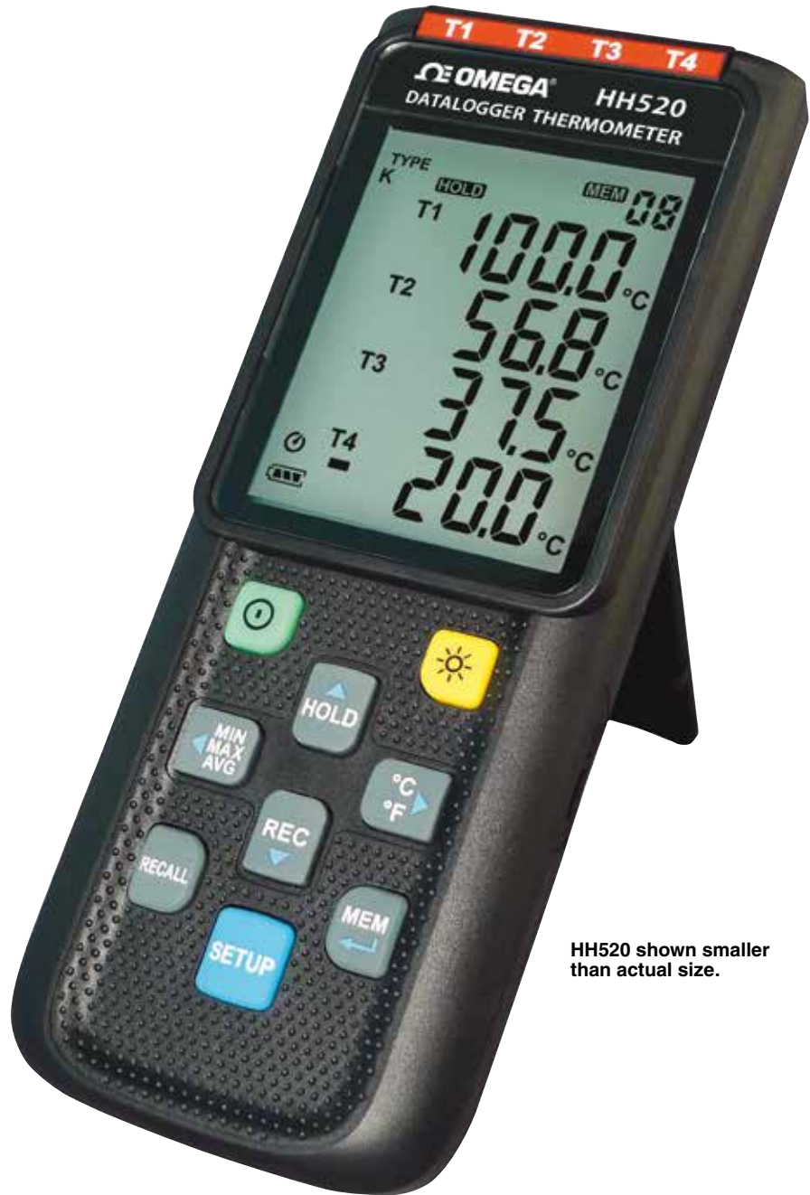
HH520 shown smaller than actual size.

The HH520 is a 4 channel handheld data logger/thermometer that accepts Types J, K, T and E thermocouples. Measurement settings and results are shown on the backlit LCD display. Data can be stored in the data logger and then downloaded to the computer or directly saved on the computer through the USB interface in real time. With the exclusive software, recording/