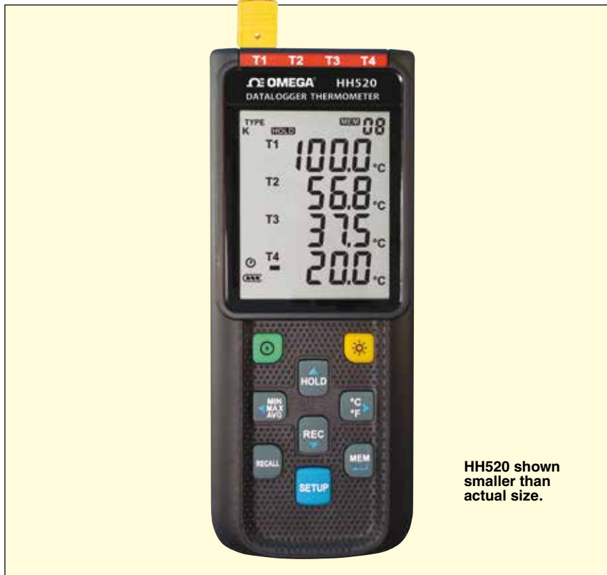
HH520 shown smaller than actual size.