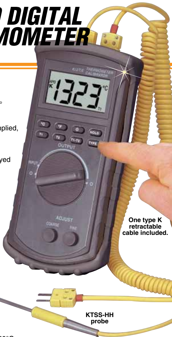
One type K retractable cable included.