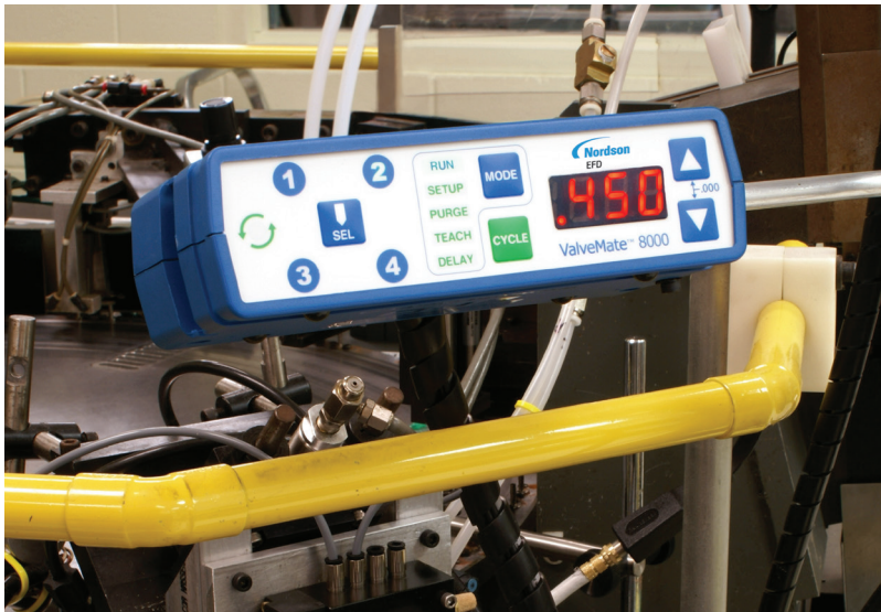
ValveMate controllers provide the primary control of deposit size.

The fastest, most precise way to adjust fluid deposits