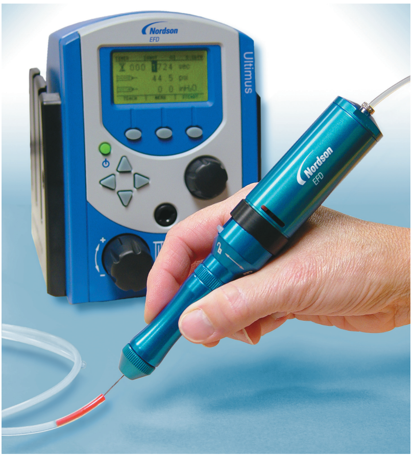
The unique HPx high-pressure dispensing tools make it easy to apply RTV silicones, epoxies, medical-grade adhesives and other very thick fluids.