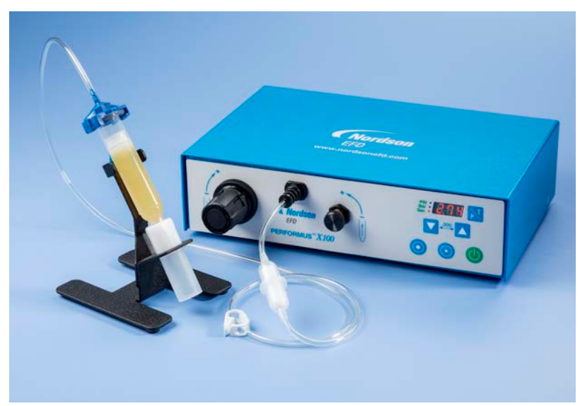
Performus X dispensers provide reliable dispensing for general applications in a wide range of industries.