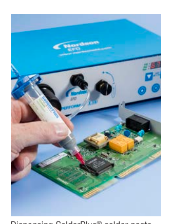
Dispensing SolderPlus ^{\! \otimes} solder paste on PCB boards.