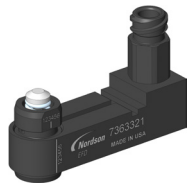
PEEK fluid body assembly