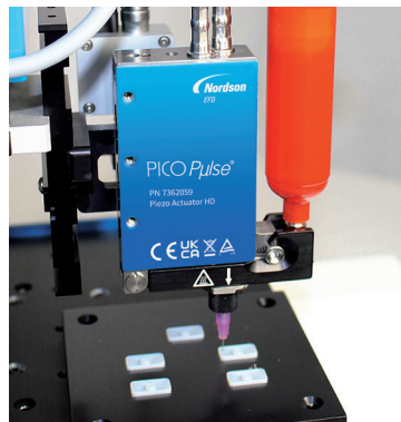
Tool-free latch simplifies serviceability, reduces downtime.

The PICO Pulse ® contact dispense valve delivers faster, more precise dispensing with less turbulence for greater fluid deposit consistency, placement, and process control. Dispense micro-deposits as small as 0.5 nL at up to 1000Hz continuous with up to 1500Hz maximum bursts* – an industry best in class.