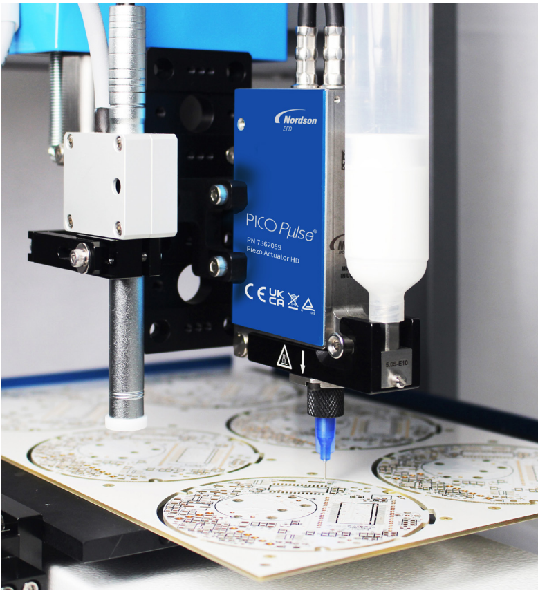
The PICO Pulse contact dispense valve provides precise, high-speed dispensing.

The Latest Advance in Precision Contact Dispensing Technology