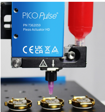
Dispense micro-deposits as small as 0.5 nL.