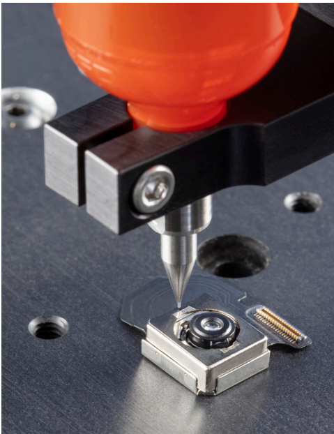
Micro-deposit dispensing onto a compact camera module.

Precision nozzles can be used without a retaining nut on 725D/DA, 741V, and 752V valves, or on a syringe.