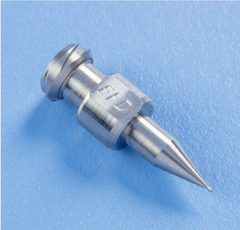
Optimum SmoothFlow stainless steel precision nozzles offer orifice sizes from 100 to 500 \mu\text{m} .

Micro-dispensing for high-precision applications