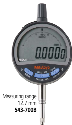
Measuring range 12.7 mm 543-700B

* Refer to "Origin Setting of Digimatic Indicators" on page F-25.