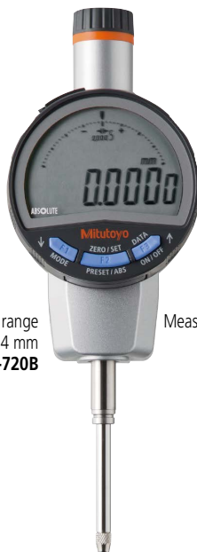
Measuring range 25.4 mm 543-720B