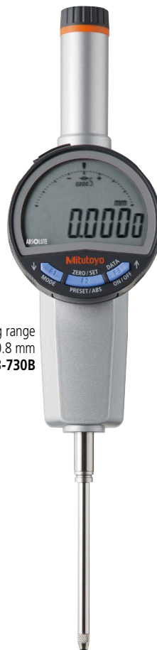
Measuring range 50.8 mm 543-730B