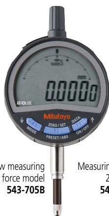
Low measuring force model 543-705B