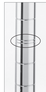
SiteSelect Posts feature double grooves every 8" (203mm) to aid assembly.