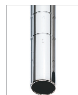
Post for Stem Caster