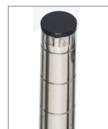
Stainless Post with aluminum cap swaged in place.