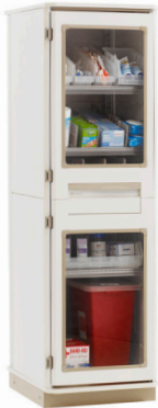
SINGLE WIDE ???