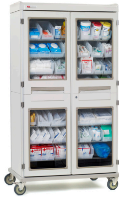
DOUBLE WIDE SXR76MXD2