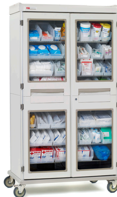
Double Wide Starsys XD Cart SXR76MXD2