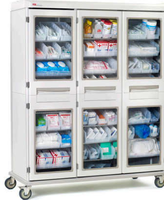
TRIPLE WIDE SXRT76MXD1