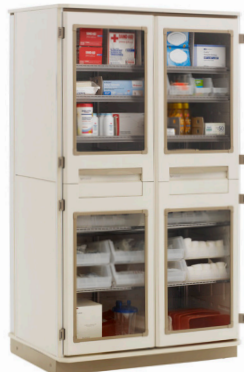
DOUBLE WIDE ???

Alternate configurations are available and can be built on the configurator.