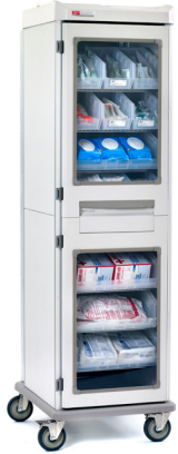
SINGLE WIDE SXRS76MXD1