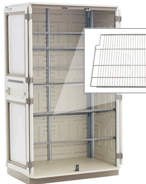
Double Wide Starsys XD Cabinet Adjustable Wire Shelving shown at -20° angle