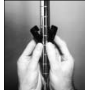
Super Erecta Split Sleeves

Every Metroseal 3 shelf and post is backed by a limited 12-year warranty against surface rust formation.