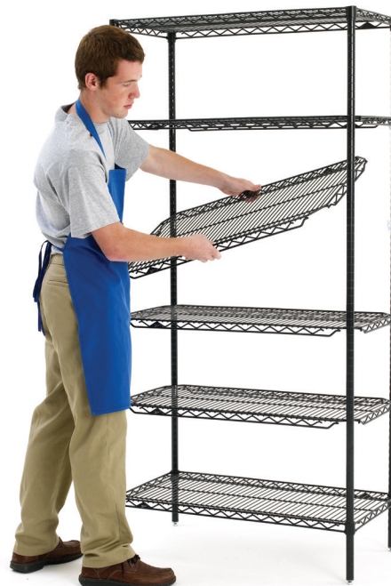
qwikSLOT® Shelving System

Metal shelf clip included with qwikSLOT® shelf.