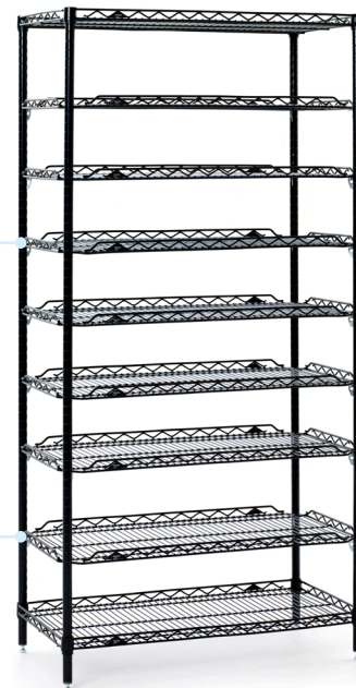
qwikSLOT® Drop Mat™ Shelving System

All Metro Catalog Sheets are available on our website: www.metro.com