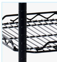
Drop Mat™ Close up