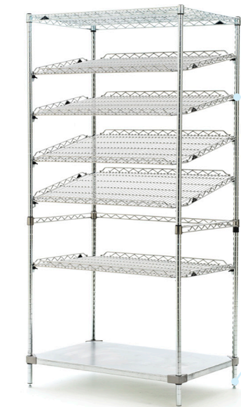
qwik SLOT® Drop Mat™ Shelving System Shown with standard solid Super Erecta® bottom shelf

Note: With 14" (355mm) shelving, foot plates must be used on freestanding units; on mobile units, maximum post height is 54" (1370mm). Note: 14" (455mm) wide shelving is not recommended for use with posts higher than 74" (1880mm).