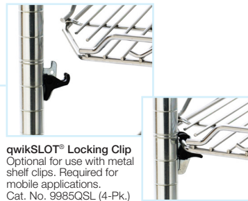
qwik SLOT® Locking Clip Optional for use with metal shelf clips. Required for mobile applications. Cat. No. 9985QSL (4-Pk.)