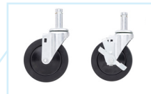
Casters Types available for all mobile applications.