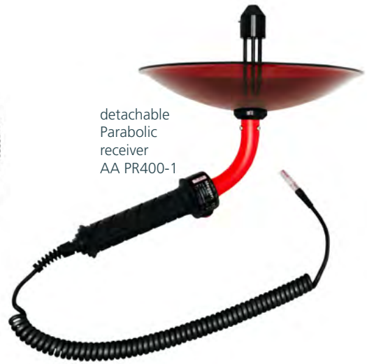
detachable Parabolic receiver AA PR400-1