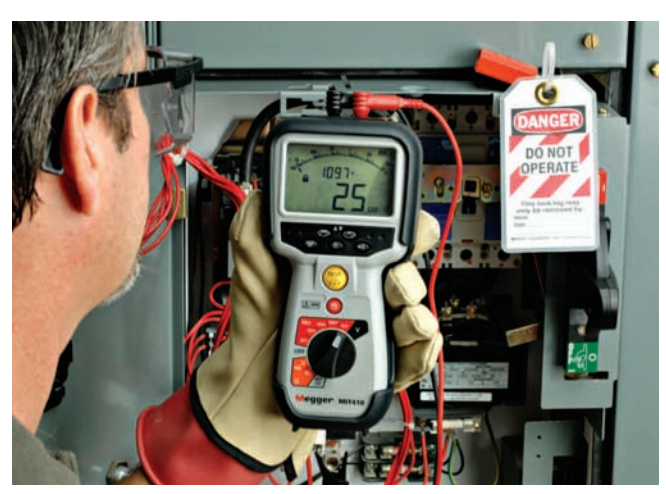
Panelboard testing is faster, easier and safer with the new MIT400 Series.