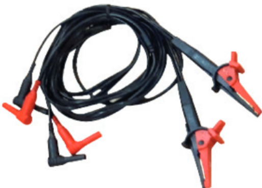
6 ft CAT IV 300 V rated compact kelvin clips, 4 mm shrouded plugs