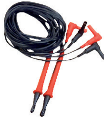
6 ft CAT IV 300 V rated compact kelvin probes, 4 mm shrouded plugs