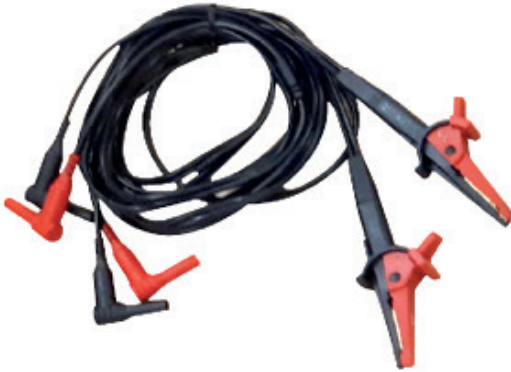
6 ft CAT IV 300 V rated compact kelvin clips, 4 mm shrouded plugs