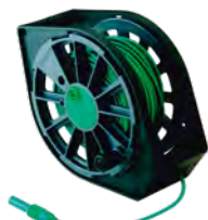
Extended test lead XTL30