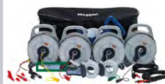
50m Earth Test Cables, Spikes & Clamps Kit

3 pcs. (4 m, 10 m, 15 m), with two earth spikes, Item no. 1001-810