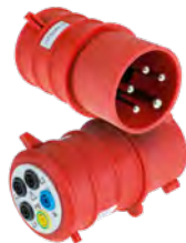
Three-phase current adapter 16A