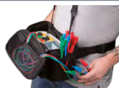
Test & carry pouch

(standard 3 wire lead set with un-fused probes and clips), Item no. 1001-99