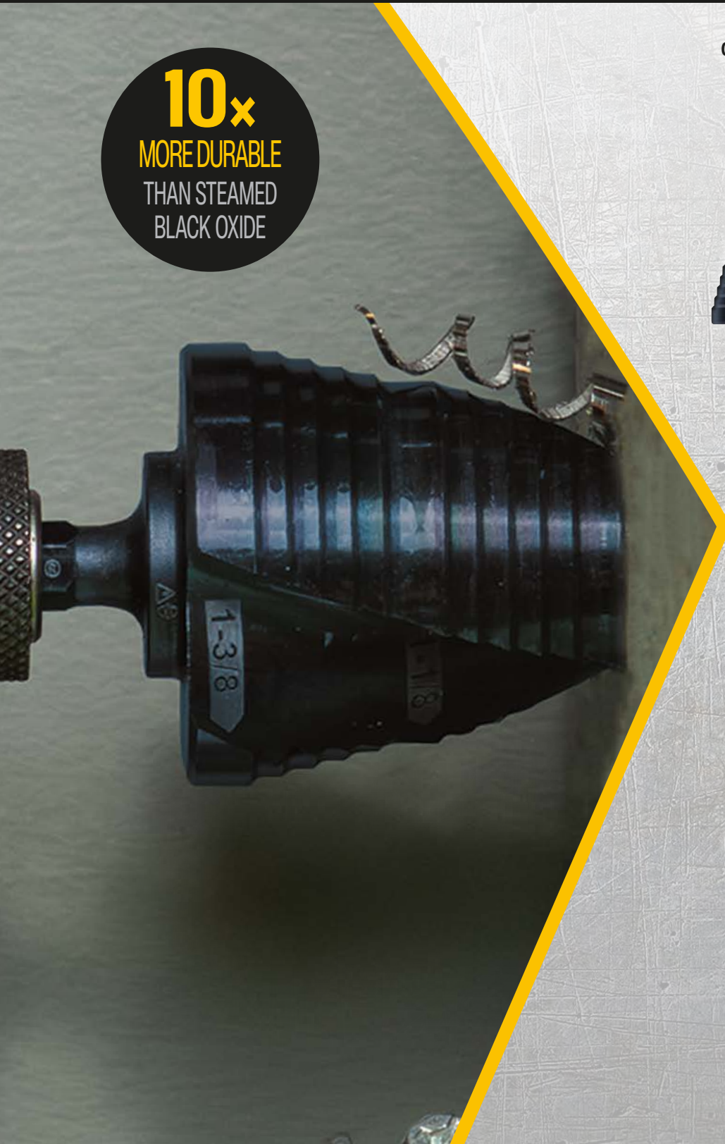
Quick-Release, 1/4" Hex with Dual Spiral Flutes

10× MORE DURABLE THAN STEAMED BLACK OXIDE