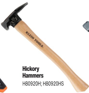
Hickory Hammers H80920H; H80920HS