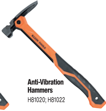
Anti-Vibration Hammers H81020; H81022

DUAL SIDE NAIL PULLERS PULLS NAILS IN TIGHT SPACES