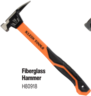
Fiberglass Hammer H80918

Precision-crafted for pulling, prying, and striking