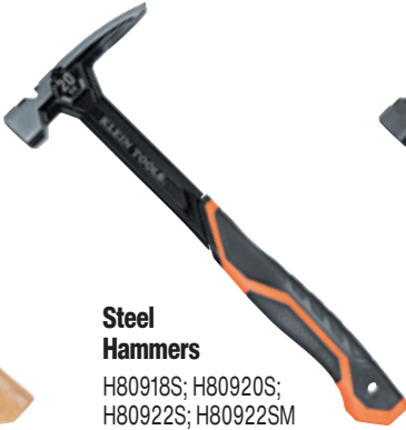
Steel Hammers H80918S; H80920S; H80922S; H80922SM