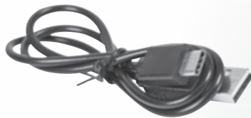
USB-A to USB-C Charging Cable