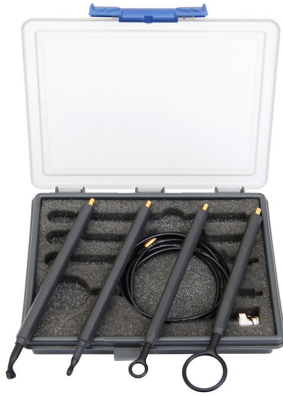
N9311X-100 (Near field probes)