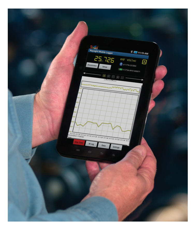
Keysight Mobile Logger Application on a tablet PC

Now, using the U1583B, electricians simply need to flip light switches to change circuit loads and read the current drawn on the hot wire with Android devices. The Android display instantly reflects how each load change affects the circuit, eliminating the need for electricians to walk back and forth between the circuit panel and the switch or end load. The Keysight solution allows electricians to extend their reach to two or three places and negate the need to be physically present at various points.