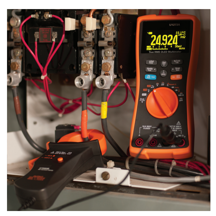
Figure 1. Measure current drawn on the hot wire with AC current clamp

With the rising popularity of smartphones and tablet PCs, electricians can now establish Bluetooth ® communication from an Android-based phone or tablet PC with an Keysight handheld multimeter via the new Keysight U1177A IR-to- Bluetooth adapter. To enable remote monitoring, users just need to install a free Android-based application called Keysight Mobile Meter. The software enables up to three real time measurement to be displayed simultaneously. Users just have to open up the panel and attach the Keysight U1583B AC current clamp to the hot wire in the circuit breaker. The U1583B AC current clamp provides an output of 10 mVAC for each ampere measured. By monitoring three circuits at the same time, this increases the chances of finding the right circuit faster.