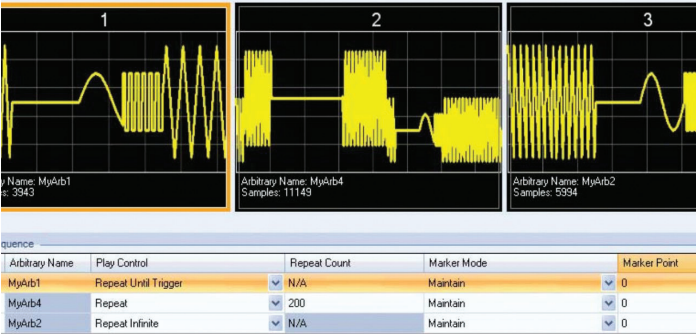
Figure 1. BenchLink Waveform Builder Pro sequencing menu.

The following is an example that uses Keysight BenchLink Waveform Builder Pro to build a new signal from a library of arbs.