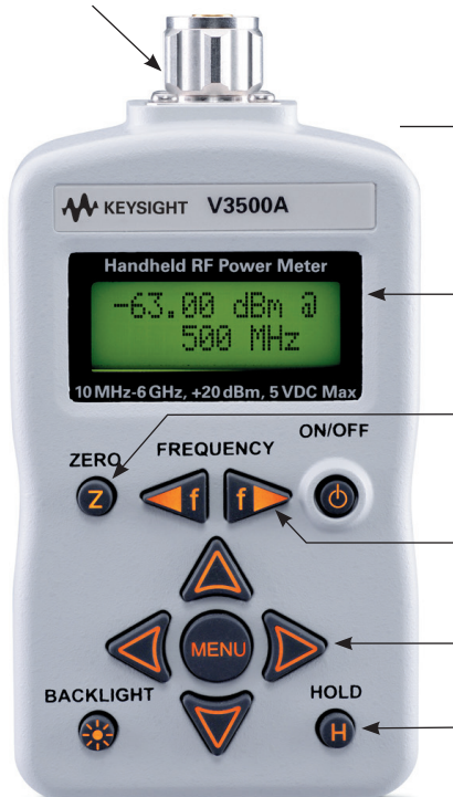
Figure 1. Signal connection

While holding the body of the power meter in one hand, turn the Type N male connector nut to tighten the connection (do not turn the body of the V3500A). Continue to do so until the connection is hand-tight. It is important to turn the nut of the connector rather than the body of the power meter when tightening the connection.